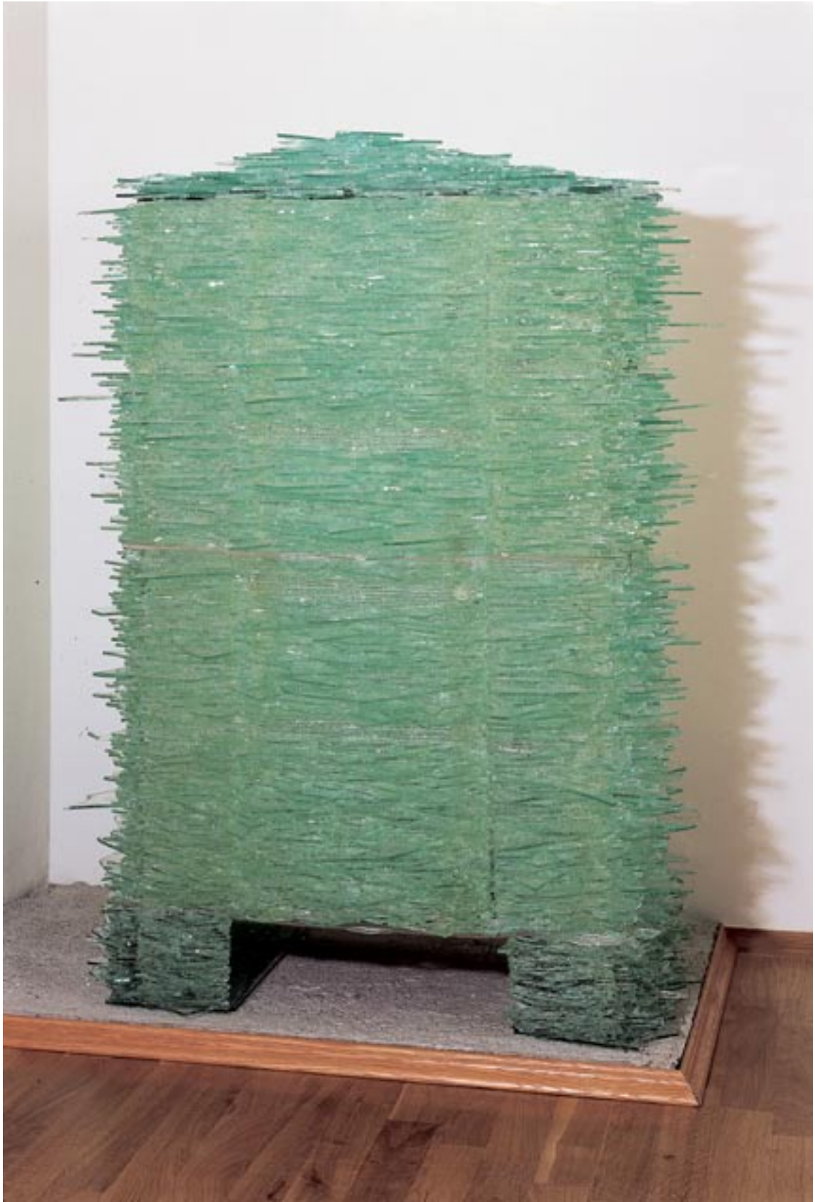
Galerie EIGEN + ART Leipzig, Installation