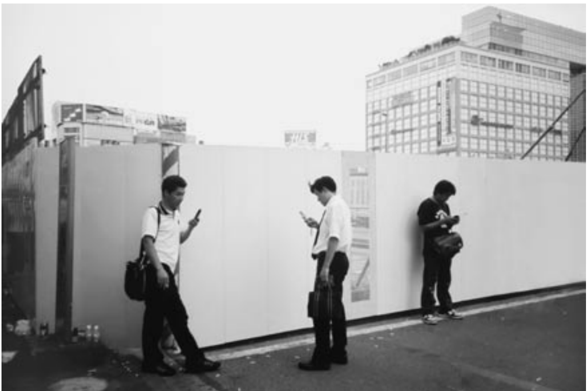
Three people on the phone #5 /#6

series of 11 b/w-silkscreens, each 70 x 100 cm, ed. 3+1 a.p. 2007