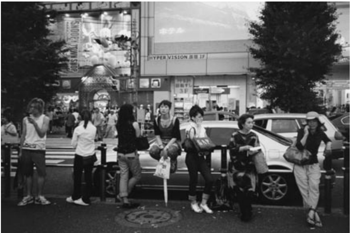
Three people on the phone # 2/ #4

series of 11 b/w-silkscreens, each 70 x 100 cm, ed. 3+1 a.p. 2007