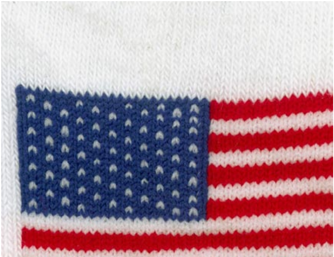
Counting Stars on American Socks, 3 c-prints , each 40 x 50 cm, ed. 3 + 1 a.p., 2004

In her series of photographs „Counting stars on American socks“ Viktoria Binschtok refers to a rather weird kind of patriotism. The miniature of the American flag on the socks she collected, in its reduction sometimes hardly seems to be more than a mere caricature. Yet, its symbolic content is still readable - a symbol for the image of the United States, its facade being fragile while its interior still seems to be safe.